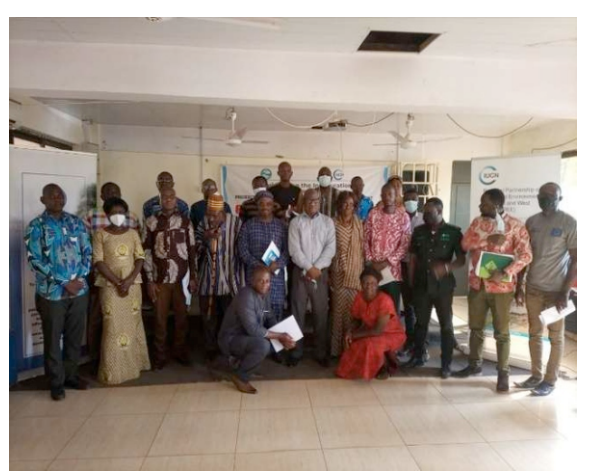
Figure 34: The Sentu/Buli Community Local Water Committee (Black Volta Basin)