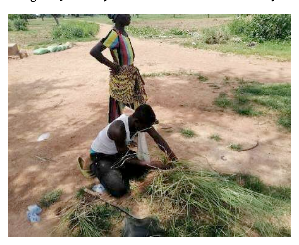
Figure 17: Vetiver Production in Gowrie Kunkua