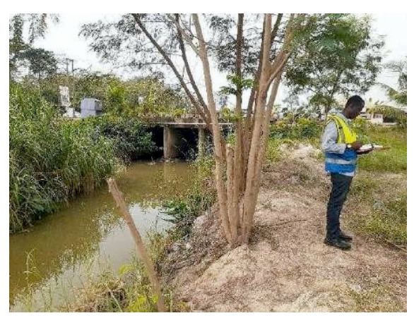
Figure 3: Ecological Monitoring in the Offin Basin (1)