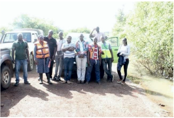
Figure 26: The Hydrometric Gauges Installation and Rehabilitation Team