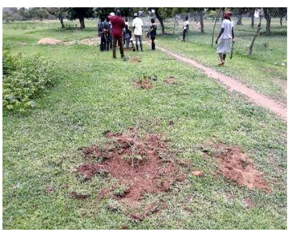
Figure 16: Tree planting activities in Akalwaka