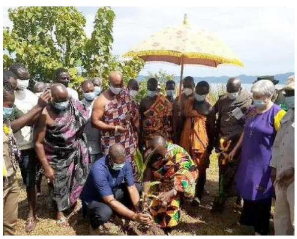
Figure 22: Restoration of Buffers in the Lake Bosomtwe Catchment (2)