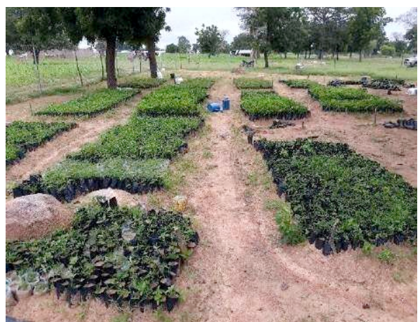
Figure 15: Nursery established Akalwaka community