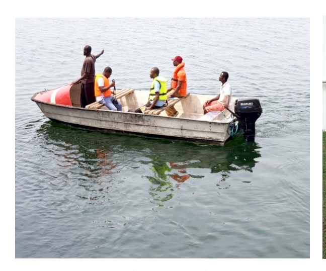
Figure 7: Inspection of Aquaculture farms on Volta Lake