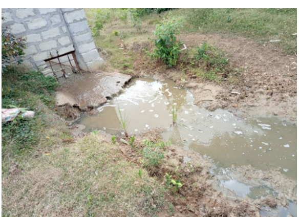
Figure 10: Wastewater from Nixin Paper Mills into Pratu River (Muni-Pomadzi Ramsar Site)