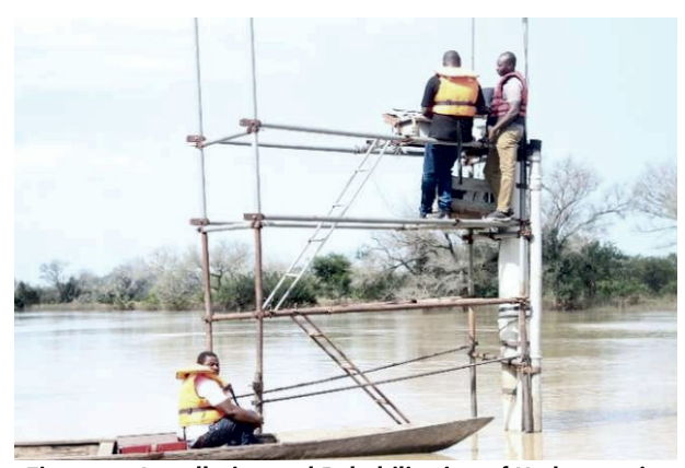
Figure 25: Installation and Rehabilitation of Hydrometric Gauges in Black and White Volta Rivers