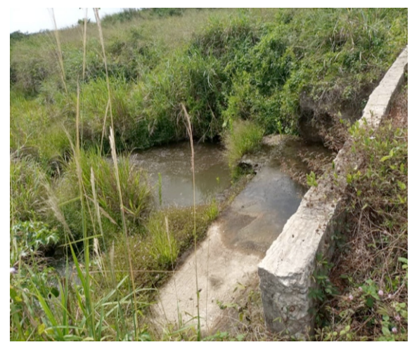
Figure 11: Weir Blocking Flow of River Asobesew by Casa de Ropa (Muni-Pomadzi Ramsar Site)