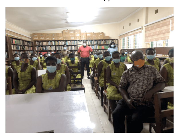
Figure 31: Education at Tarkwa Senior High School (Ankobra Basin)