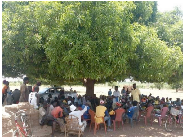
Figure 27 Sensitization at Lambo Community in the Lambusie District