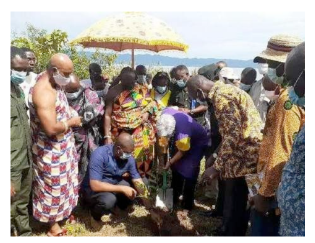
Figure 21: Restoration of Buffers in the Lake Bosomtwe Catchment (1)