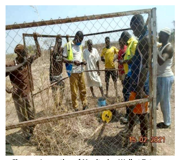
Figure 5: Inspection of Monitoring Well at Tatunya