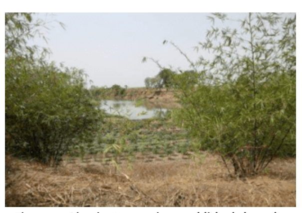
Figure 20: Riparian Vegetation established along the Kulpawn River in Sakariba