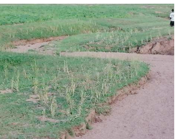
Figure 18: Vetiver Planting in Gowrie Kunkua