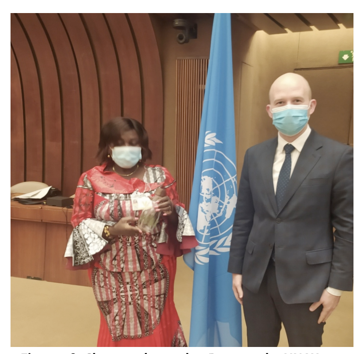
Figure 38: Ghana welcomed as Party to the UN Water Conventions

to benefit from the commitments made by some international organizations including the UNECE and the International Office for Water to facilitate funding of priority transboundary interventions; and to support execution of the national Implementation Plan, capacity building in the critical area of groundwater monitoring, and assessment, set up of joint bodies for transboundary basins such as Tano and Bia, and the assessment of progress on the SDG 6 targets on water resources management (Figures 38-39).