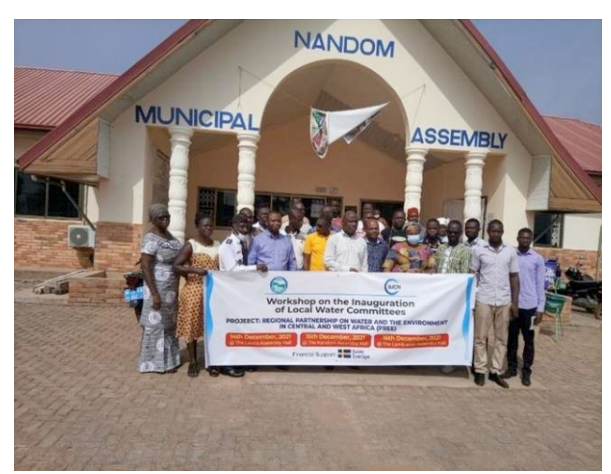
Figure 33: The Kamba Community Local Water Committee (Black Volta Basin)