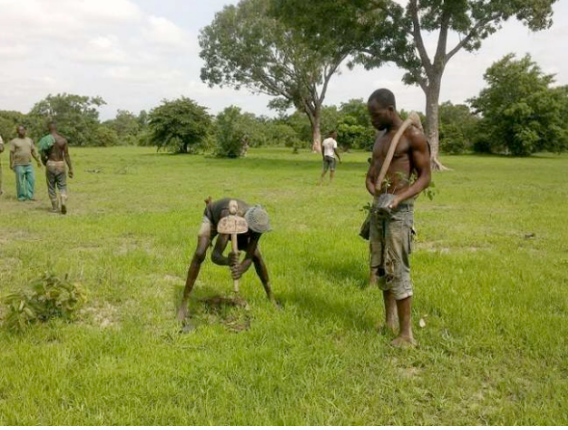
Figure 24: Tree Planting by communities in the Black Volta Basin