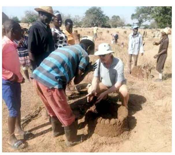
Figure 14: Inspection of Tree Seedlings using Mud Fence in Lungi