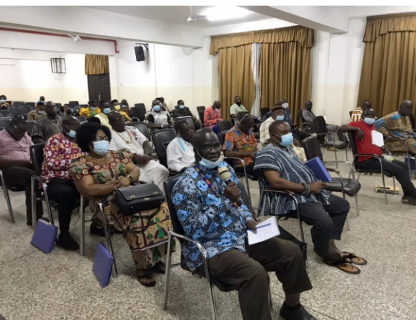
Figure 36: Traditional Authorities at Sensitization Workshop on the UNESCO IHP