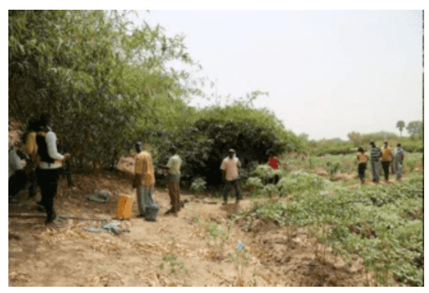
Figure 19: Working to establish Riparian Vegetation along the Kulpawn River in Sakariba