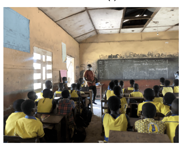
Figure 32: Education at Wassa Agona D/A Primary School (Ankobra Basin)