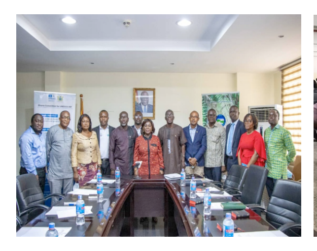
Figure 35: Members of the Reconstituted Ghana Committee of the UNESCO IHP