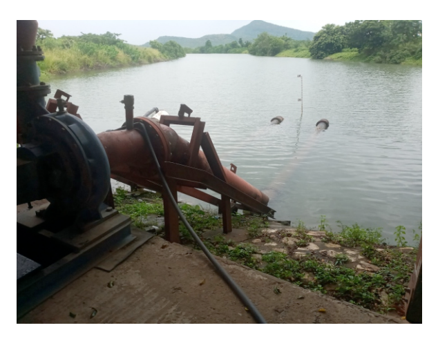
Figure 9: Site inspection of a Water Abstraction Point