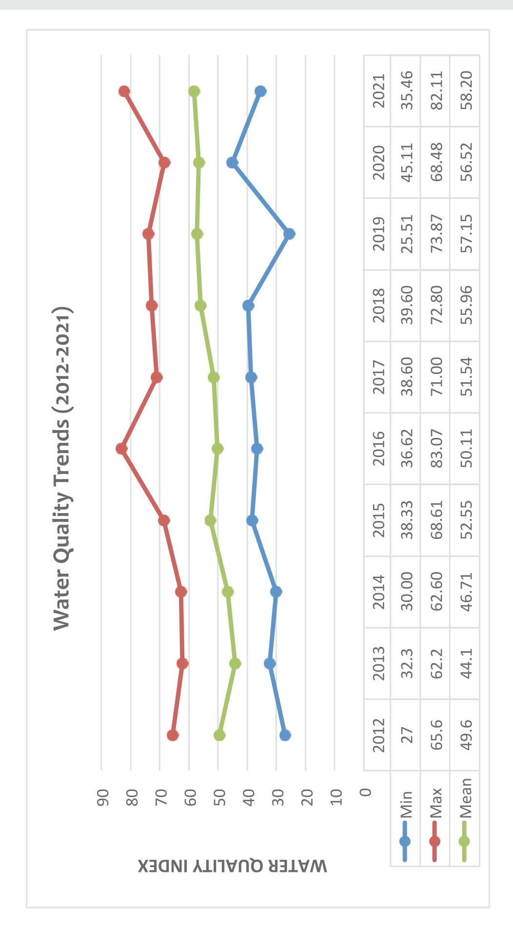
Figure 37: Trends of Water Quality from 2012 to 2021