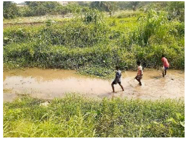
Figure 4: Ecological Monitoring in the Offin Basin (2)