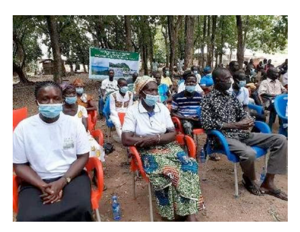
Figure 29: Community Outreach in the Lake Bosomtwe Catchment (1)