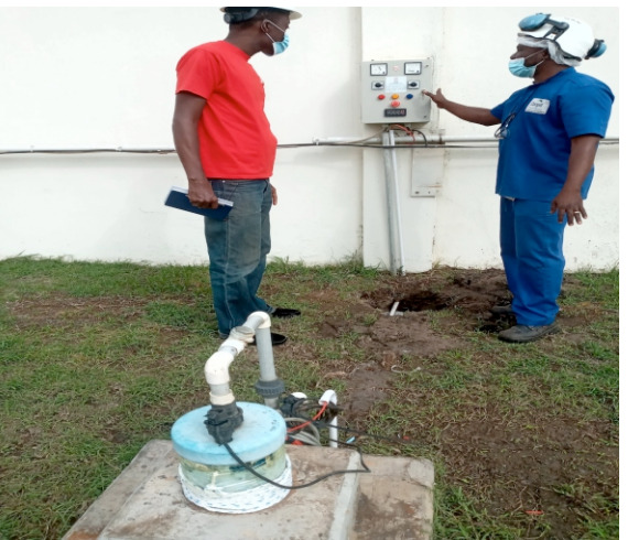
Figure 8: Inspection of GHACEM Water Facilities