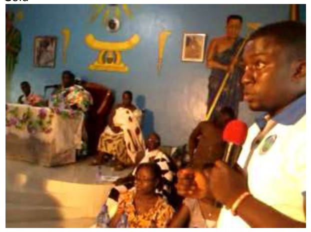
Figure 8: The Assistant Ankobra Basin Officer making a presentation at the Traditional Council meeting