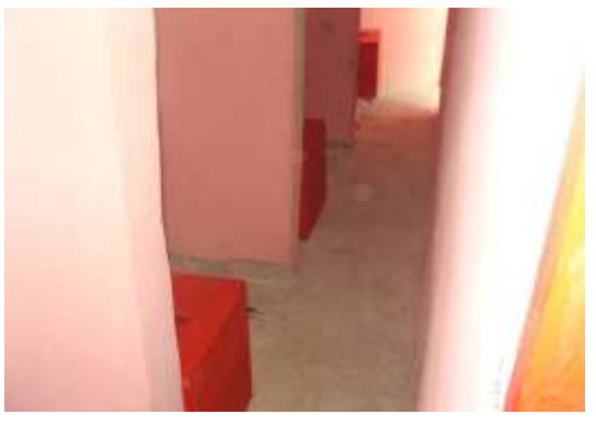
Sooba: Toilet facility gated and mounted with seats