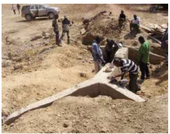
Figures 12: Spillway of a small reservoir at Apatanga in the Bongo District