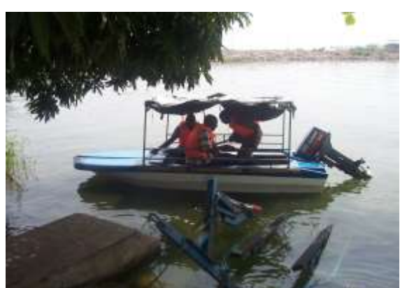
Figure 5: Carrying out routine monitoring with the donated Equipment on the Weija Lake