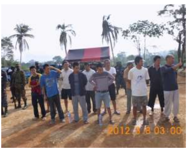
Figure 7: Some suspected foreign nationals involved in illegal mining