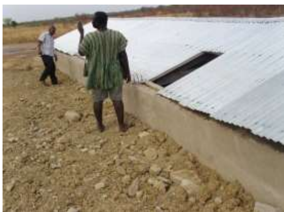
Figures 14: Before and after rehabilitation of flood water harvesting facility at Sooba