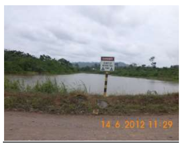
Figure 6: Compliance Monitoring; a water dam at Noble Gold