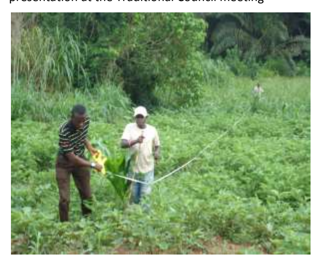
Figure 10: Assistant Pra Basin Officer assisting in measuring the buffer width along the River Offin at Offinso