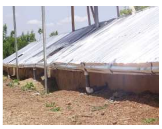
Figures 13: Before and after covering of rainwater harvesting facility at Daboya community