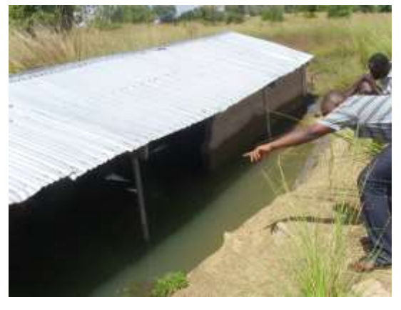
Sooba: Broken wall of water facility