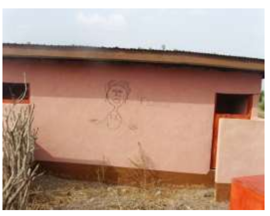
Figure 15: Toilet facilities provided to Sooba and Bunyamo communities