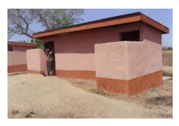
Sooba: Toilet facility without gates